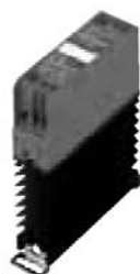
Power SSR with diagnostic SILD (see page 155)