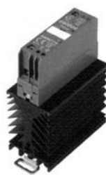
Single Phase SIM 45 mm