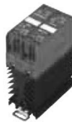
Two Phase SIB (see page 153)