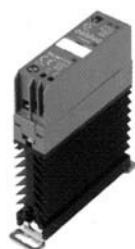
Single Phase SIL 22.5 mm