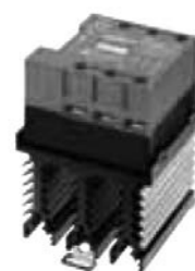
Three Phase SIT (see page 154)