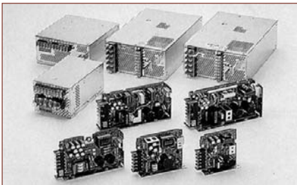
P15, P30, P50, P100, P150, P300, P600, P1500, PT1500