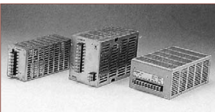
AD240, AD480, AD960